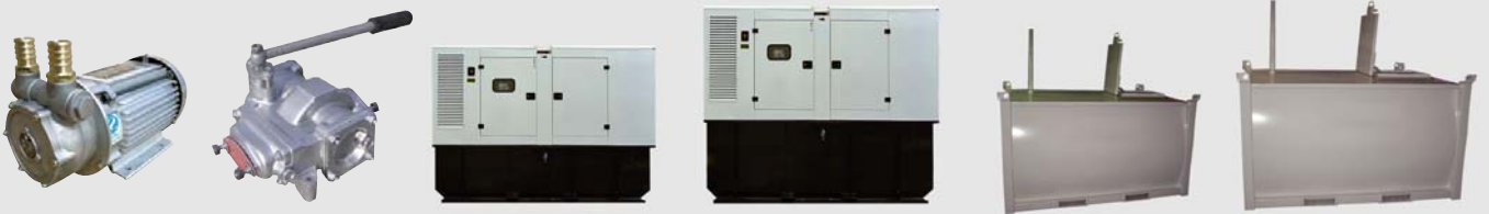
Auto filling fuel pump