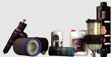
500 hours genset spare parts